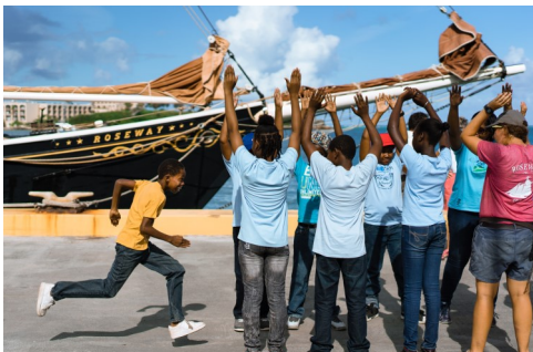
Students participate in activities for the Roseway on St. Croix.

Since 2006, World Ocean School has been providing transformative experiential education programs for students aboard the historic schooner, Roseway . With funding from CFVI, WOS maintained its efforts despite post-hurricane challenges, offering extracurricular programming to 292 elementary, junior high, and high school students from eight condemned schools in St. Croix during the 2017-2018 school year.