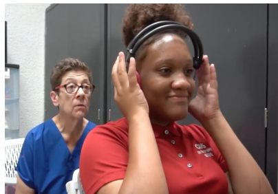
A student in St. Croix receives a hearing screening from an AFT Nurse.

In conjunction with the Clinton Global Initiative Action Network, CFVI partnered with Airlink and the American Federation of Teachers (AFT) to provide vital preventative health screenings to over 5,000 students throughout the Territory. Airlink associates Jet Blue, Spirit Airlines and United Airlines provided transportation to the USVI for 24 AFT nurses who conducted health assessments, while CFVI provided funding and coordination assistance to facilitate the nurses' visit, which took place in early April.