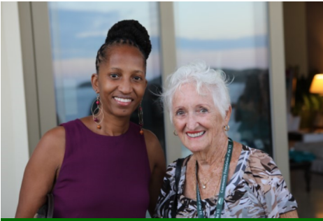
Two of our Angels attend the annual Angels appreciation reception in May 2018.

Hurricanes Irma and Maria left a devastating mark on the landscape, infrastructure and residents of the Territory. But, thanks to 20 YEARS of ANGELIC support, CFVI was in a position to serve as a philanthropic first responder just days after Hurricane Irma's arrival in the Territory. Angels are those essential people in the life of CFVI who make an annual gift of $500 or more. People from all walks of life are CFVI Angels. Programs, operating costs, and much of our community outreach are provided each year through generous donations from CFVI Angels. Angel gifts support all we do in the community.